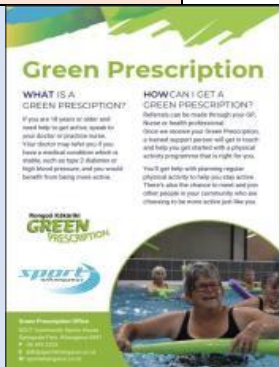
Green Prescription (Sport Whanganui – Kaumātua Exercise Classes)