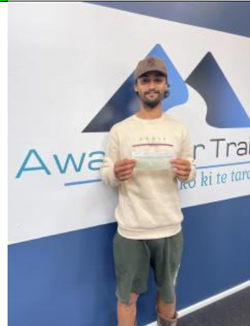
Our Rangatahi (TM – Driver's Learner Licence)