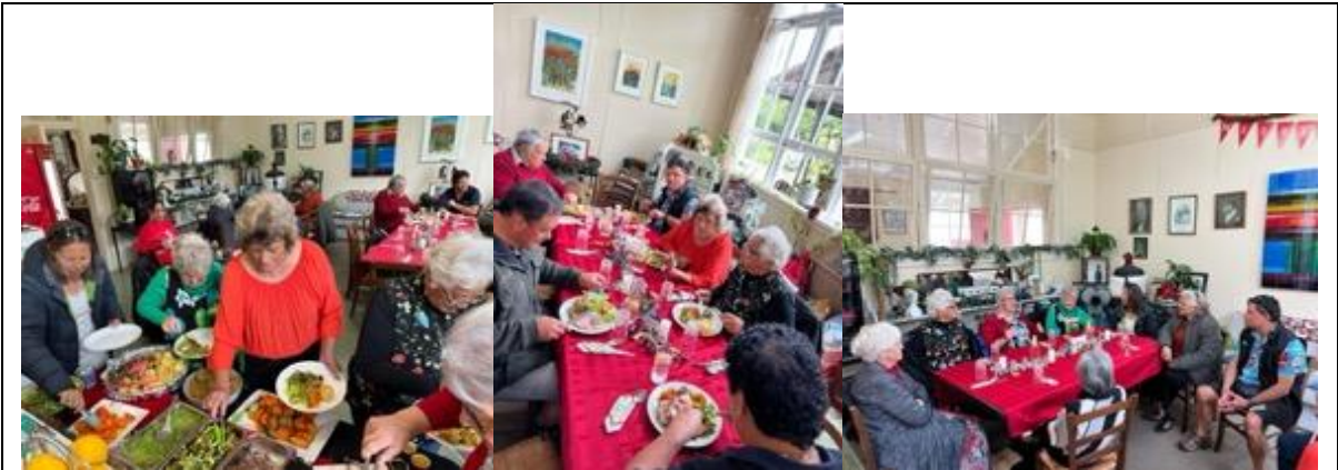
Honouring our AWA Kaumātua