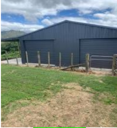
Hub Classroom (DIA – Reporting on Progress)