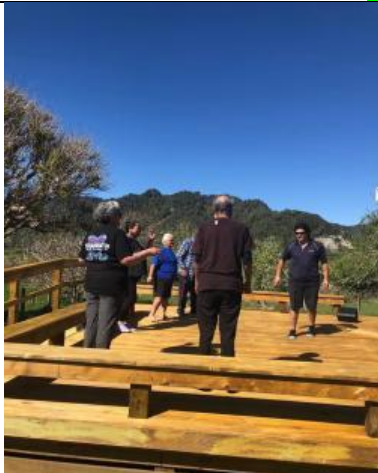
Our Kaumātua @ HUB (SW – Exercise & Companionship)