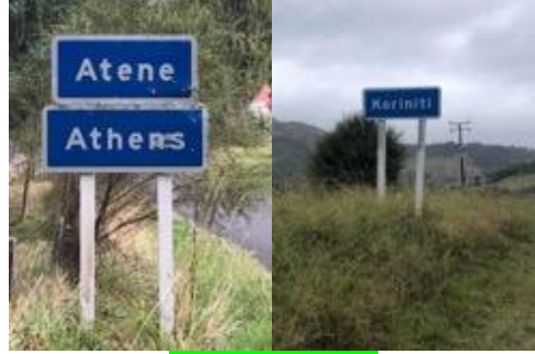
RFP CLDP 2 2024 (DIA – Real Me Application)