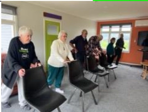
Our Treasured Kaumātua @ HUB (SW – Exercise & Companionship)