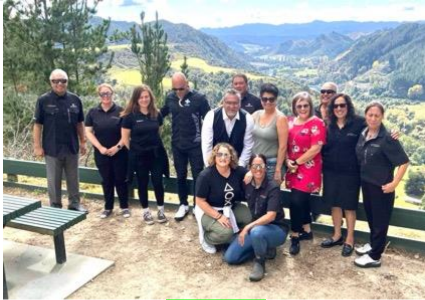
NHC Visit to TCLT (Rural Health Care along the Whanganui River Road)