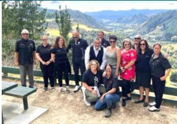
Visit by NHC – National Hauora Coalition (Rural Health Care Partnering Opportunity)