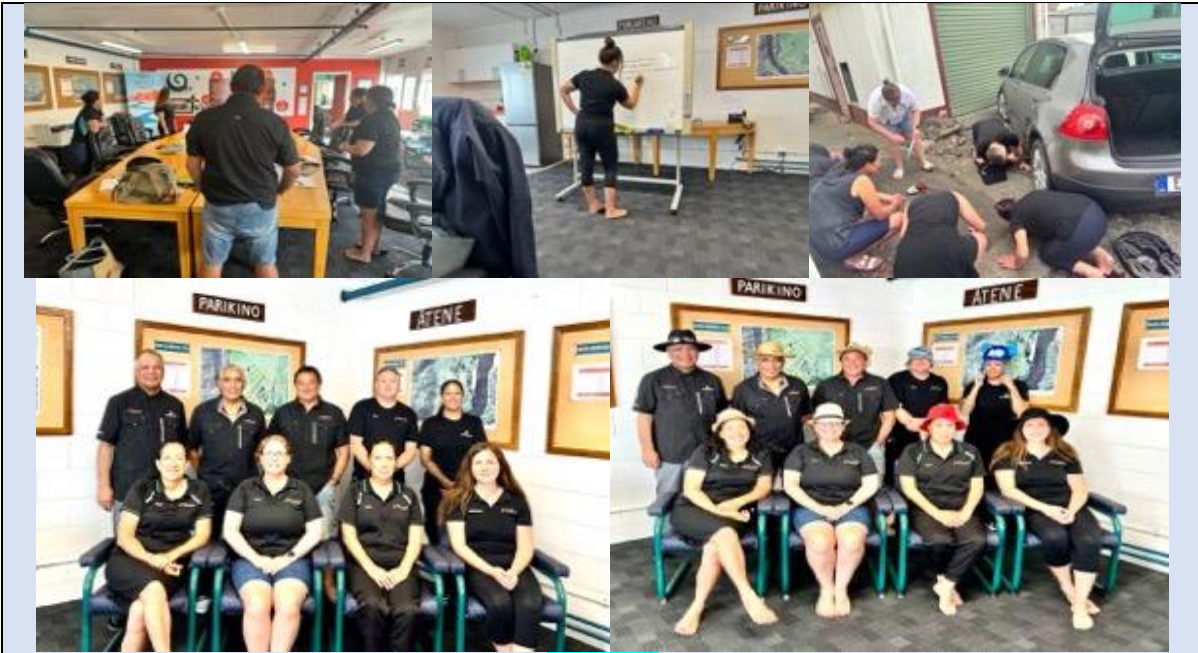
TCLT 2024 (He Tima Kotahi – He Tima Pukumahi)