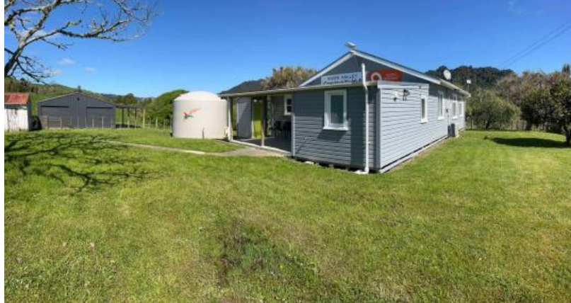
River Valley Community Hub (TCLT – Maintenance)