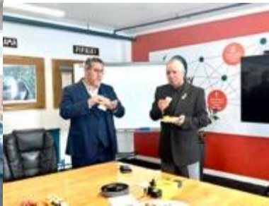
NHC Executive & TCD/ TCT (Partnering Agreement Signing Ceremony)