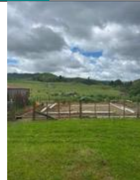
6 December 2023 (Hub Workshop)