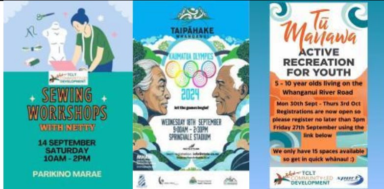
Community Programmes (TCLT – Valued Providers)

Relationships of Respect & Responsibility