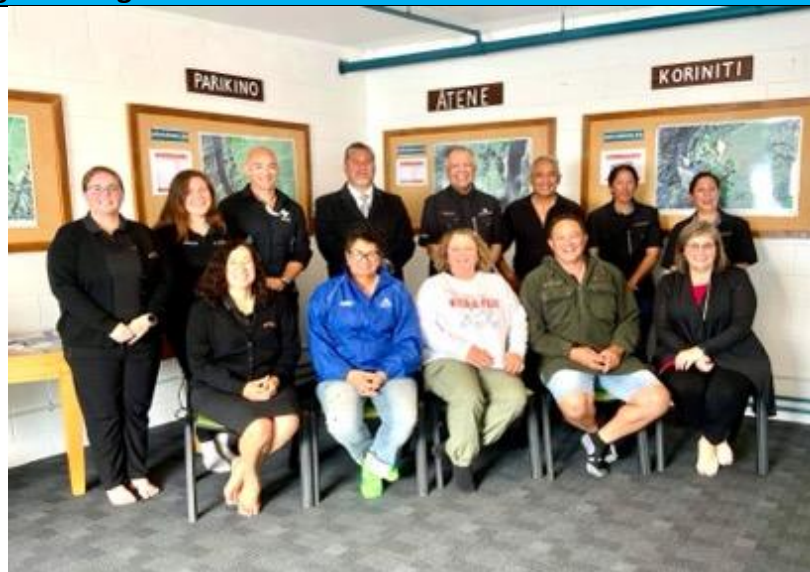
Visit by NHC – National Hauora Coalition (Rural Health Care Possibilities)