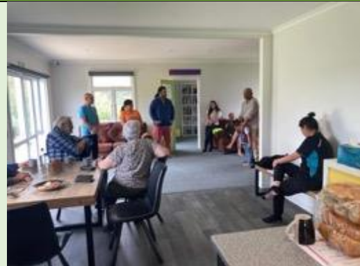
AWA Kaumātua Wellbeing (TCLT Mirimiri Workshop)