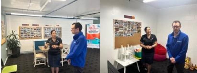
Carl Bates (Whanganui Member of Parliament)