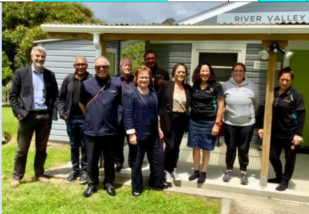
MSD Whanganui Region EMT & TCLT