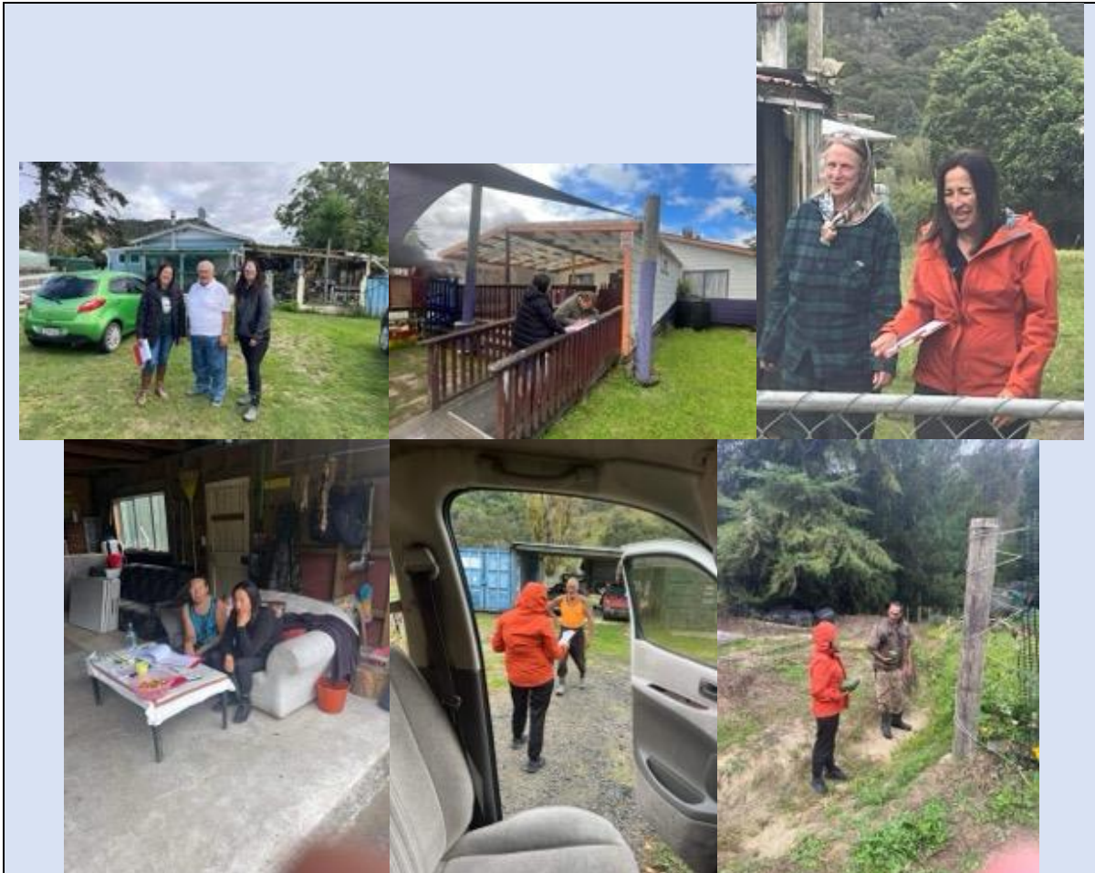
TCLD & TCLT Request for Partnership Application 2024 (Confirming Community Support Whānau-by-Whānau)