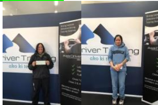
Our Dynamic Rangatahi (TCLT – Driver's Licence Workshop for Mobility)