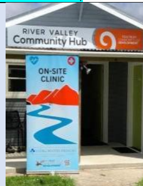
On-Site Clinic (Living Waters – Fortnightly Service Provision)